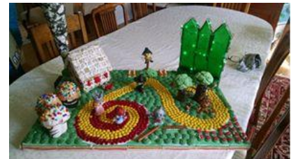
"Wizard of Oz" Winning Entry