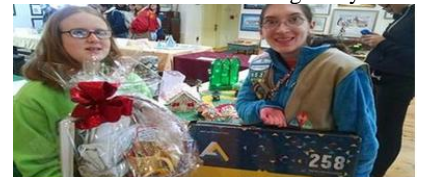
Proud first place winners!