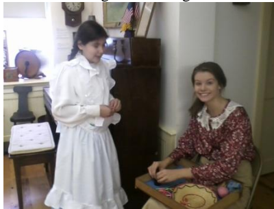
Girl Scouts portraying school girls from the 1800's.