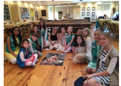
Learning about Juliette Low