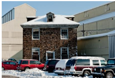
Photos of the Wertmüller House

This yearly event featured the Steel Mill and the Wertmüller House.