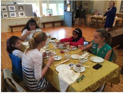
Enjoying Afternoon Tea