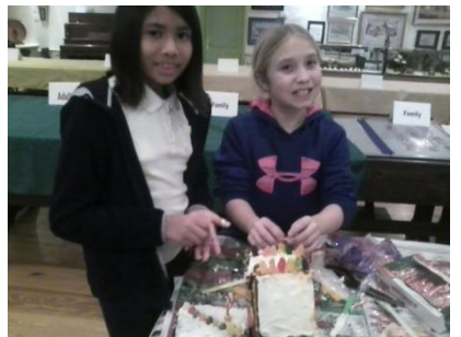
Girl Scouts making gingerbread houses to enter in the contest