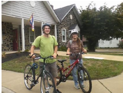
Participants arrived by shuttle bus, car, by foot and by bike.