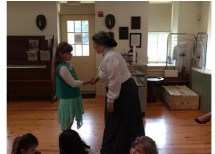
Learning to make proper introductions

Scouts enjoying old fashioned crafts, activities and Afternoon Tea