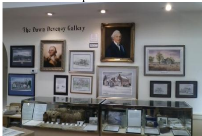
The Dawn Deveney Wall was installed.