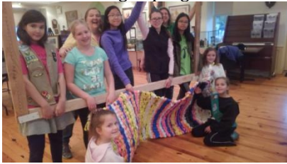
Scouts pose with the loom and a finished sleeping mat.