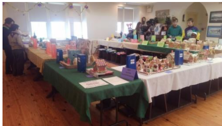
19 houses were entered.