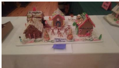
This entry featured reindeer made out of pretzels.