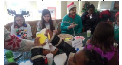
Girl Scout Troop 311 helped visitors make ornaments during the Gingerbread House Contest.