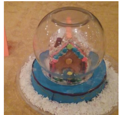
A gingerbread house in a snow globe.