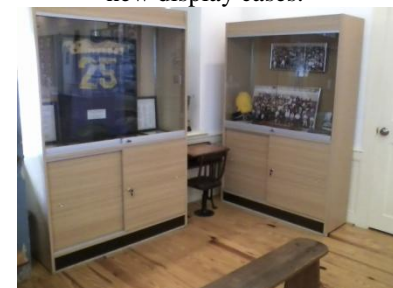
The new display cases