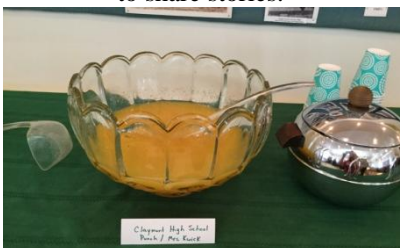
Favorite recipes were shared.