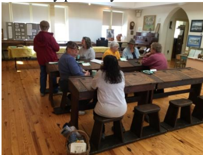
Claymont Remembered Event Participants gather to try to food and to share stories.

We look forward to another activity packed year in 2018.