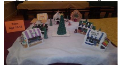
An entire village.