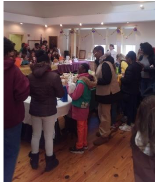
244 people visited and voted on their favorite entries.