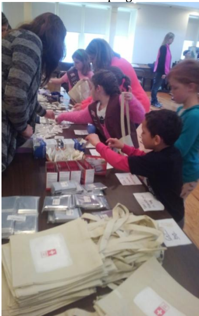
Scout troops and family members assemble first aid kits for the homeless.