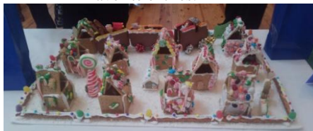
Entries were made by families, preschools, after school programs, Scout groups, young children, teens and adults.