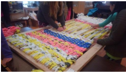
Weaving in progress.