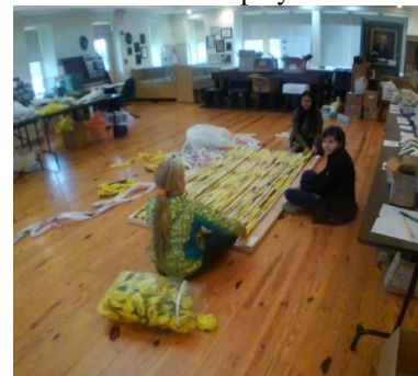
Troop 311 weaves a sleeping mat for homeless people at the "Help Us Help the Homeless" event.